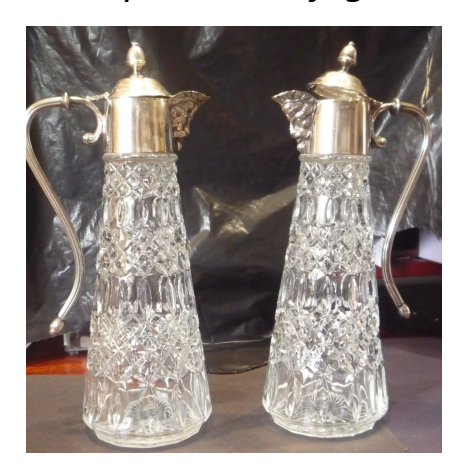
European wine jugs

The Grand Master is now obliged to drink all that is present in the chalice and then invert the chalice over their head as a Sign of their good office.